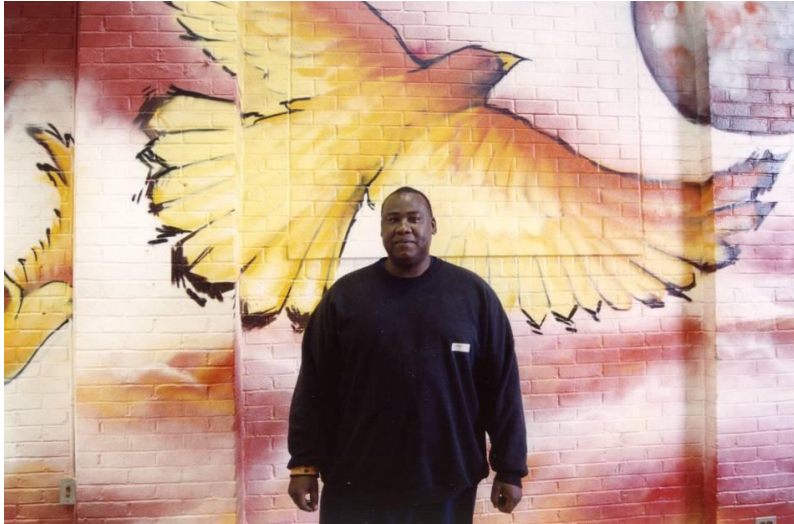
Inmate in front of Mural at Kingston Penn